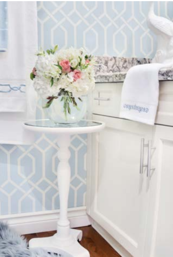
ABOVE: The soft palette from the main level continues upstairs in the master bedroom, which is tranquil and comfortable. LEFT: The homeowners and Duclos selected wallpaper with a bold pattern for the powder room.

“Whenever the McAuslans can do something themselves, they like to,” says Duclos. For example, Les painted the fireplace and Helen applied the gold leaf to the mustache pulls on her dining buffet. Riley Painting Corp. updated the online find with a shiny coat of blue paint (they also painted the master bedroom and main staircase and hung the wallpaper in the powder room).