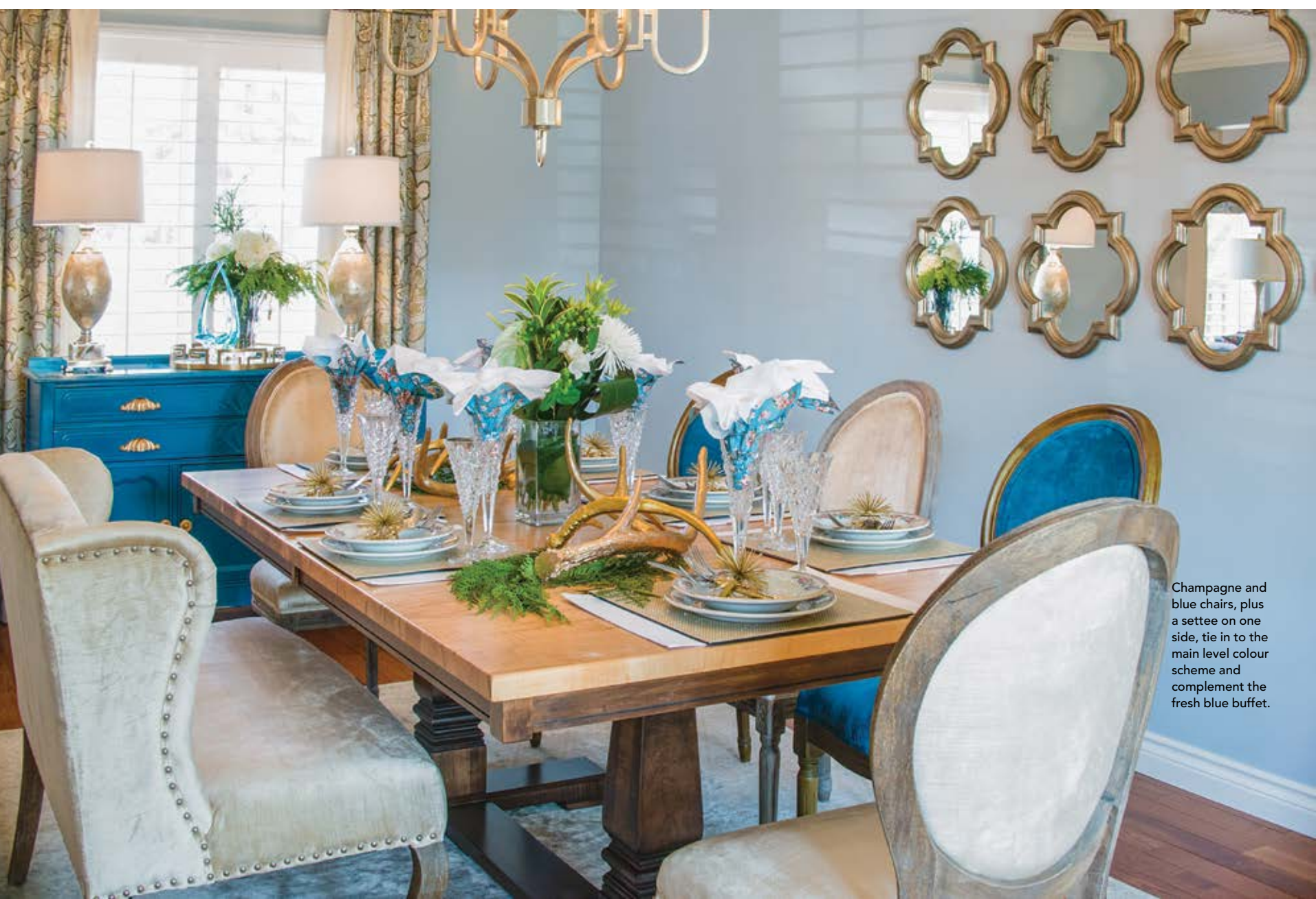
Champagne and blue chairs, plus a settee on one side, tie in to the main level colour scheme and complement the fresh blue buffet.

“She asked us both what colours our eyes go to,” says Helen. Having gone through the earth tones in previous design schemes she did herself, Helen says she was ready for something fresher. Duclos suggested she look in magazines and mark rooms that appealed to her. When Helen went back and reviewed everything she’d marked, she found she was drawn to a grey and blue palette. Duclos was off and running.